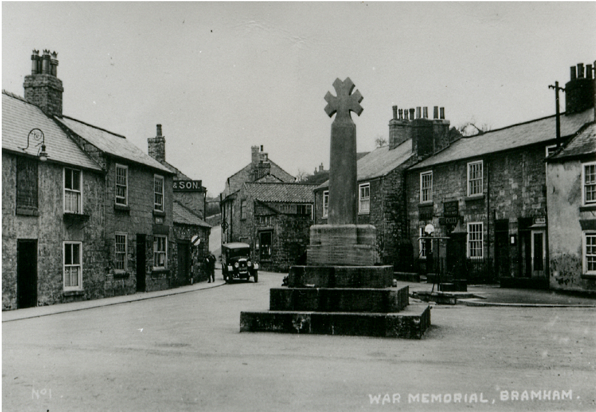
WAR MEMORIAL, BRAMHAM.