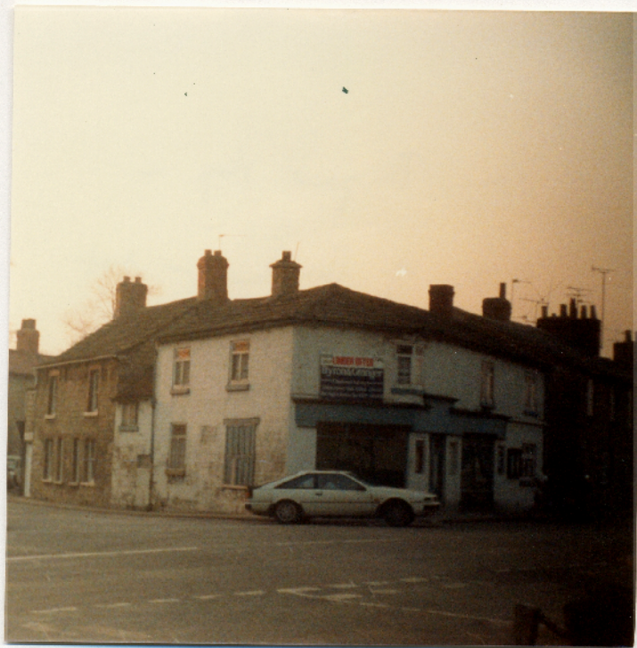
Amy's (Amy Thompson's shop, before conversion) just after her death in 1998. Sale price after conversion £95K.