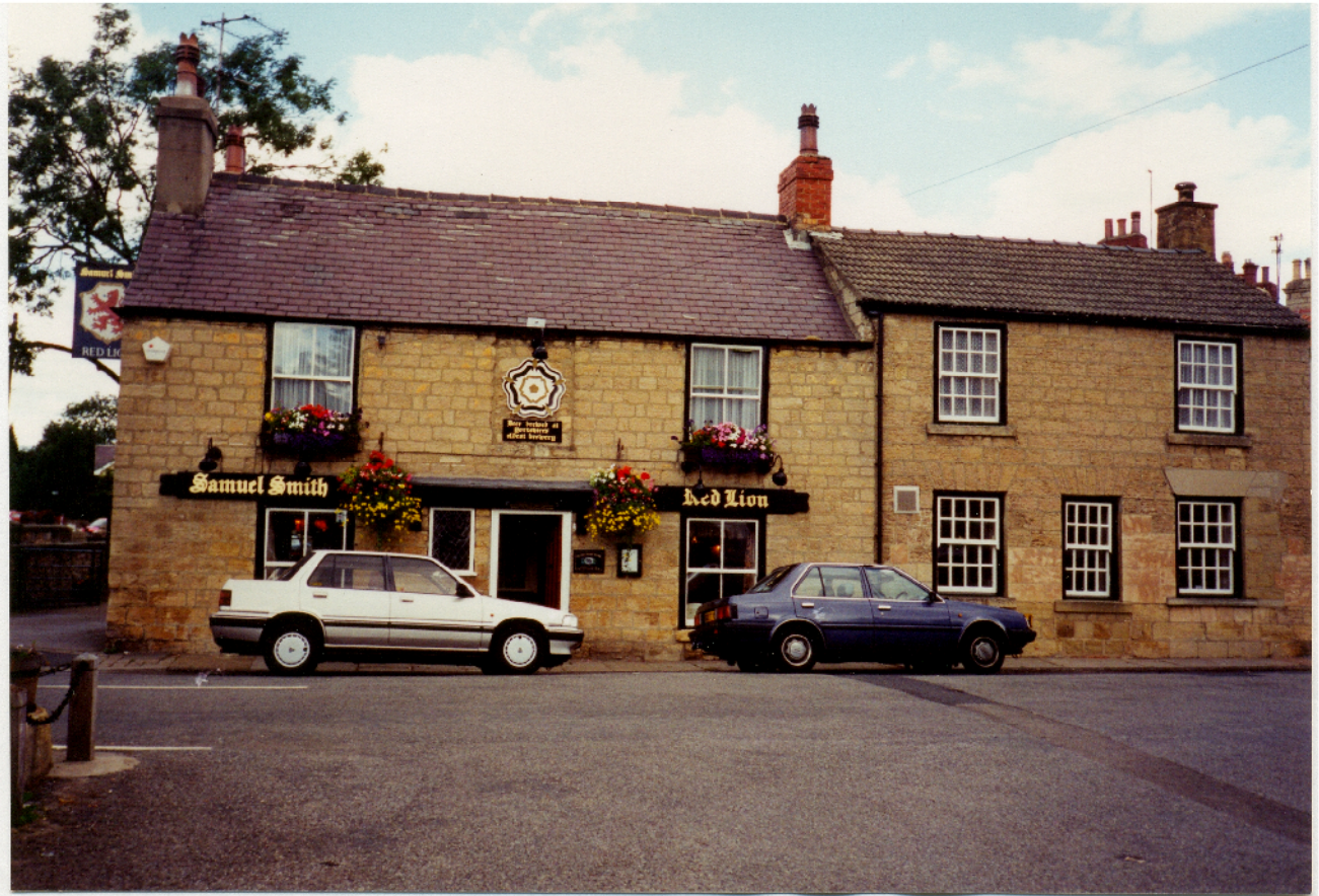
The Red Lion. See book page 14.